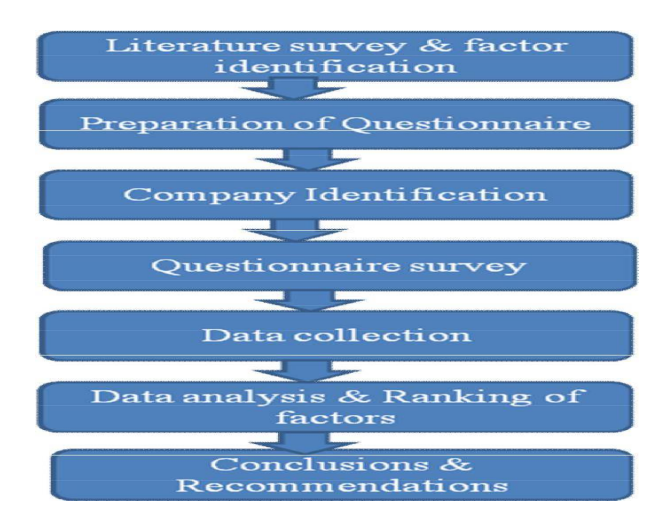
Fig 1: Methodology

The philosophy embraced in this review is the accumulation of information by the strategy for study. A few strategies for gathering data from the business were assessed from different literary works. The flowchart underneath speaks to the procedure embraced for the review. After writing study, the organization must be recognized. At that point the surveys must be arranged and given to contractual workers and venture experts. At that point the information's from the organization must be gathered and examine by utilizing SPSS programming. The positioning of the variables is finished by utilizing Relative Significance Record. Utilizing that information's the main considerations that influencing the quality must be recognized. At that point from the outcomes reasonable recommendations must be given to the organizations for enhancing their item quality.