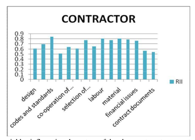
Fig 2: Rank of variables influencing the nature of development ventures contractual workers see

Conformance to codes and principles has been positioned by the temporary workers respondents in the primary position with RII equivalent to 0.8472. This component is the most essential one for contractual workers since this variable is an imperative agreeable to proprietor. The proprietor normally looks to execute extend as indicated by standard codes determination. This element is huge for temporary workers since this variable is emphatically identified with customer fulfilment.