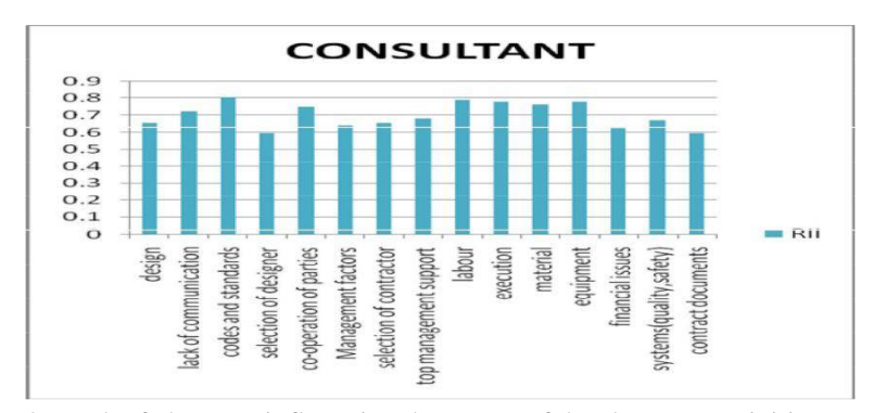
Fig 3: Rank of elements influencing the nature of development activities consultantsee

Conformance to codes and principles has been positioned by the specialists respondents in the primary position with RII equivalent to 0.8055. This element is an essential to specialist's illustrative fulfilment since it is primarily identified with proprietor fulfilment.